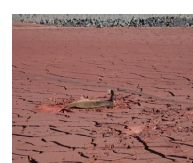
Impacts to fauna