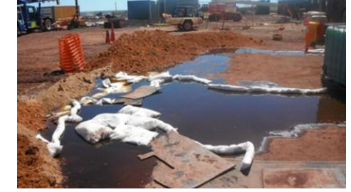
Large oil spill from a temporary storage tank