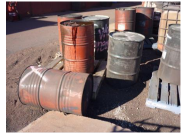
Unbunded oil drums