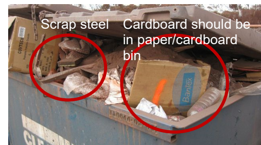
General rubbish bin waste not segregated