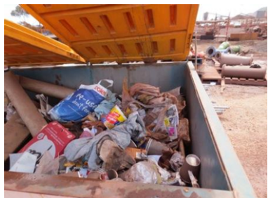
Contaminated cardboard bin