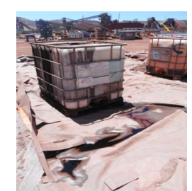
Oil spills/ leaks onto compromised temporary bunding