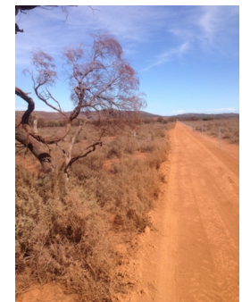
Unauthorised vegetation clearance