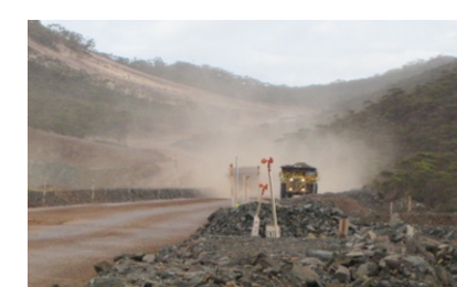
Fugitive dust from vehicle