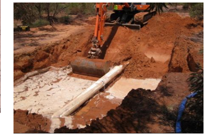
Water leaks greater than 1000L