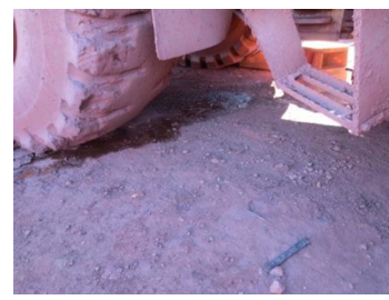
Hydraulic oil leak from truck