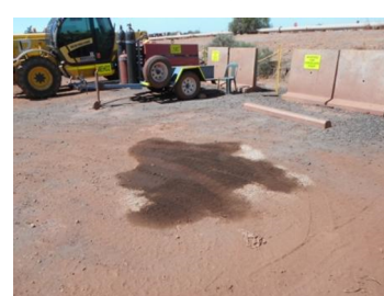
Oil leak to unsealed ground