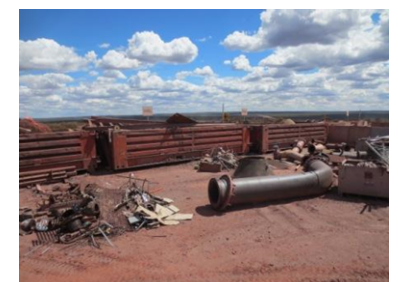
Piles of rubbish left for long periods